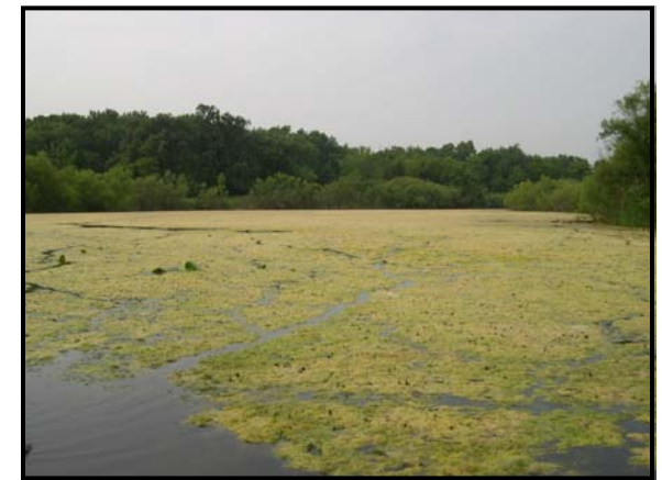
Excessive phosphorus can lead to algal blooms in lakes.