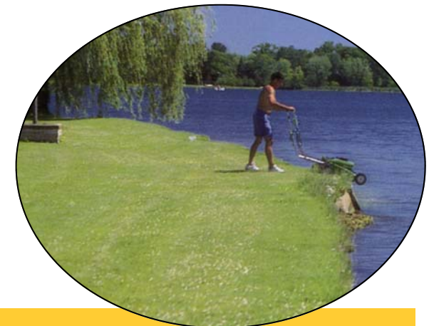
Grass clippings add phosphorus to lakes.